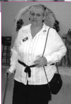
Volunteer showcasing her selections from Vicky's Values