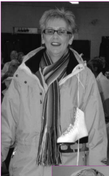
Modelling outerwear and skates as an example of what you can find at Vicky's Values

The month's activities concluded with Repairing the Bridge – building more inclusive services for native women and women of colour workshop with presenters Audrey Huntley and Zahra Dhanani.