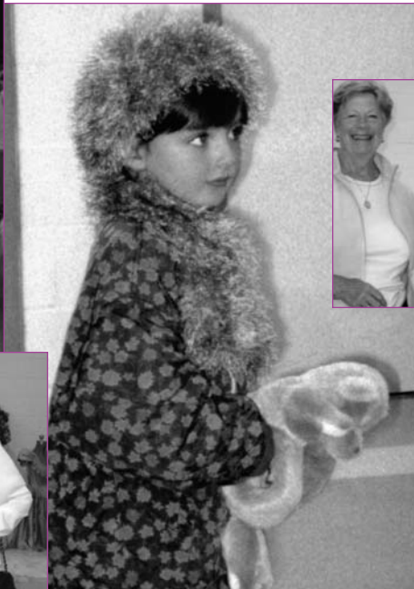
Our youngest volunteer steals the show